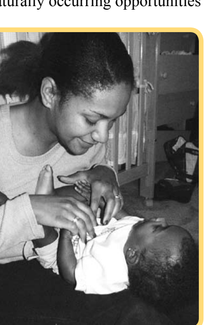
The little ones pictured above respond gleefully to the rewarding responses, such as tummy tickles and smiling faces, that their actions prompt during active learning games.

Everyday parent/child interactions are excellent times for helping the very young child learn the relationship between cause and effect—the powerful understanding that HE or SHE can make things happen! Diaper changes, mealtimes, reading a story, riding in the stroller or grocery cart ... all are excellent, naturally occurring opportunities